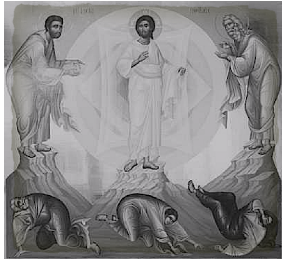
The Transfiguration - 6 th August

The parish magazine of St Mary's & St Luke's Serving the communities of Rope, Willaston & Wistaston.