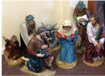
The completed figures enhancing the lobby of the Church Hall for the Christmas period

Thank you Art for all your hard work! This is an abridged version of Art's journey with the Nativity characters - we hope to have copies of the full version available soon.