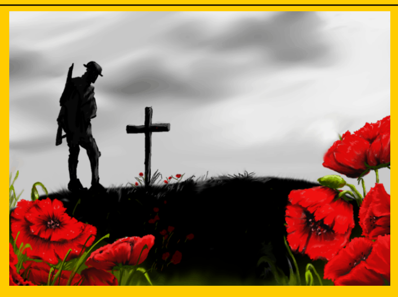
10th November Remembrance Sunday at both Churches