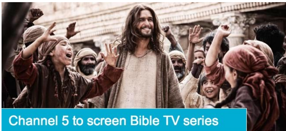
Channel 5 to screen Bible TV series

From reality producer Mark Burnett, The Bible is a five part/ten hour docudrama series which re-tells famous stories as they unfold and reveals new insights into these iconic characters in context of the Bible. The series will feature some of the most