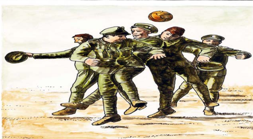
A CHRISTMAS TRUCE - 1914

10.40am Holy Communion for Christmas for all the family