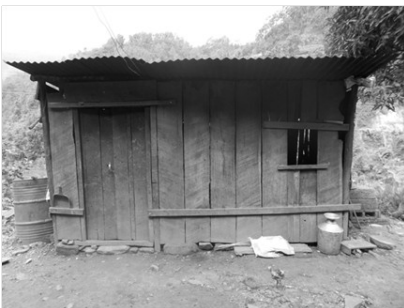
The 'kitchen', separate from host home