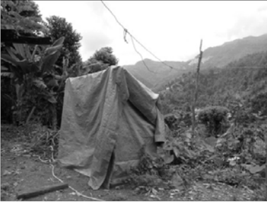
A temporary shower, constructed of bamboo and tarp

Life here in Nepal is not completely basic, but it lacks some of the comforts of my own home. Aside from the obvious luxuries such as internet or a sofa, trivial things make it very different also. For example, I shower under a tarp shelter with a bucket and the electricity sometimes cuts out because of the monsoon. However, the joys here make the challenges so worth it. It's the intangible connections you make and other aspects that make it an overwhelmingly positive experience.