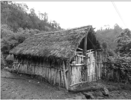
A typical rural house

with living in a different environment away from everyday luxuries of home.