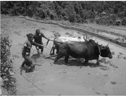
Local community members using an ox to plough their fields

The first has to be the views. We are based in Makwanpur and so, unlike the Gorkha teams, we don't get see glimpses of the Himalayas. Nevertheless, the views are spectacular with rolling mountains as far as the eye can see, all covered in thousands of trees. You can see where nature has carved away rock and streams dot the landscape. I will miss doing mundane tasks with such a spectacular view.